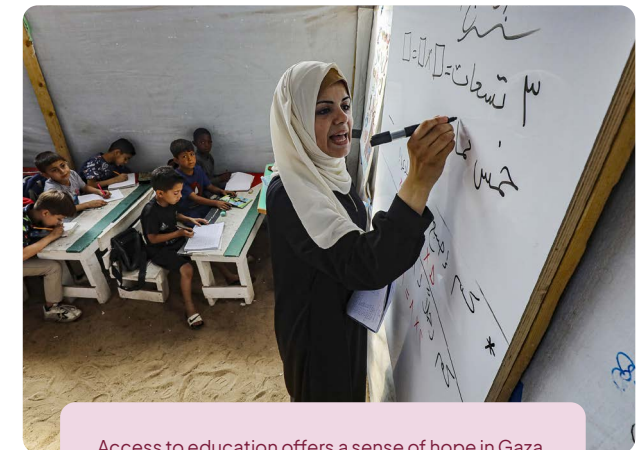
Access to education offers a sense of hope in Gaza.

More aid reaches children in crisis situations, and more measures are implemented early to counteract the worst consequences of natural disasters. Long-term recovery and reconstruction efforts further contribute to strengthened resilience over time.