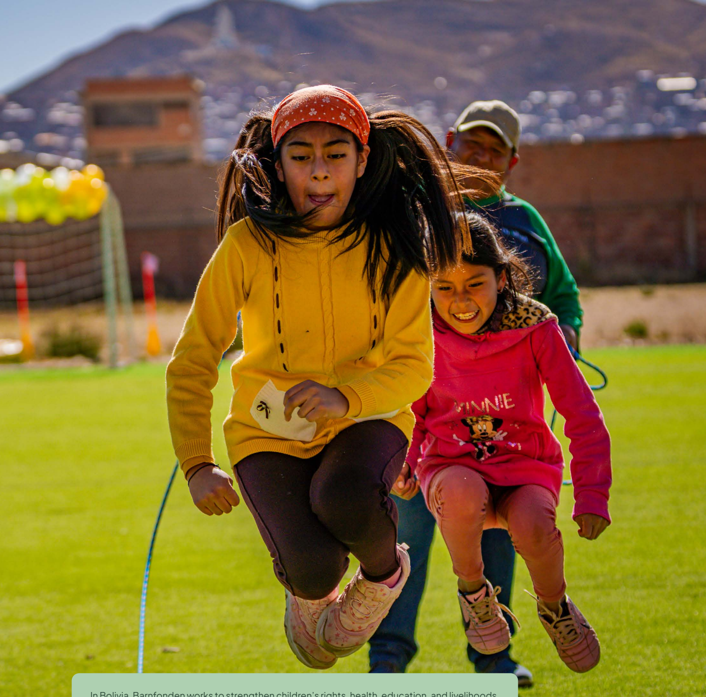
In Bolivia, Barnfonden works to strengthen children's rights, health, education, and livelihoods.