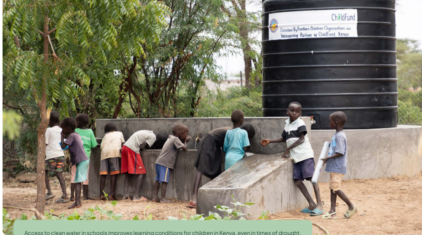
Access to clean water in schools improves learning conditions for children in Kenya, even in times of drought.

Through strategic partnerships and networks, we increase our impact, exchange knowledge and resources, and create results greater than the sum of their parts. We are a clear and active voice; we build partnerships that strengthen our understanding, financing, and influence, and ensure that all participation is results-oriented and strategically linked. As an active member of ChildFund Alliance, we purposefully contribute to strengthening the network and take responsibility in line with our mission and goals.