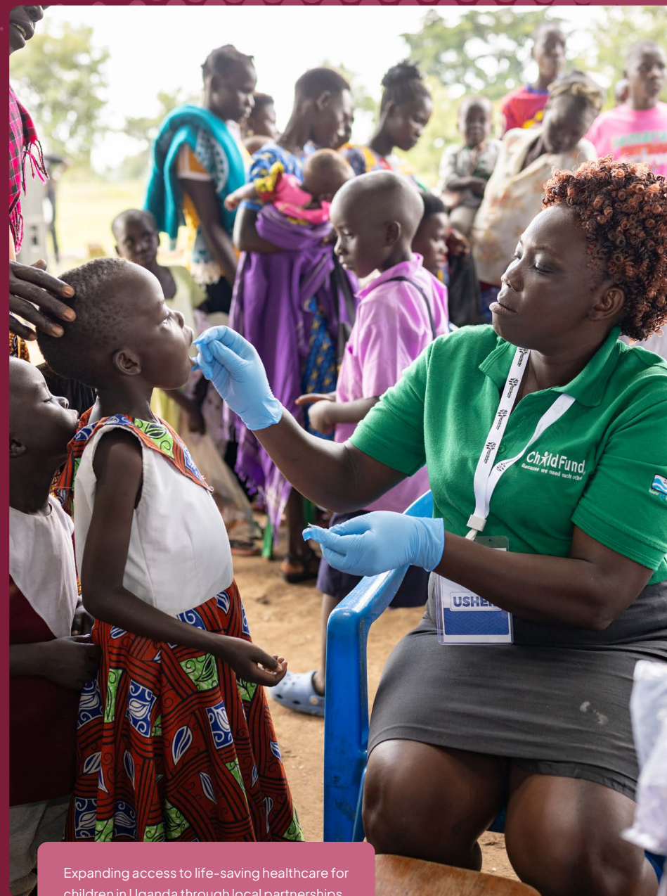
Expanding access to life-saving healthcare for children in Uganda through local partnerships.

Goal: Increase the effective and impactful support provided to local partners working for children's rights in both humanitarian and development contexts, through capacity development, financing, partnerships, and innovative collaboration.