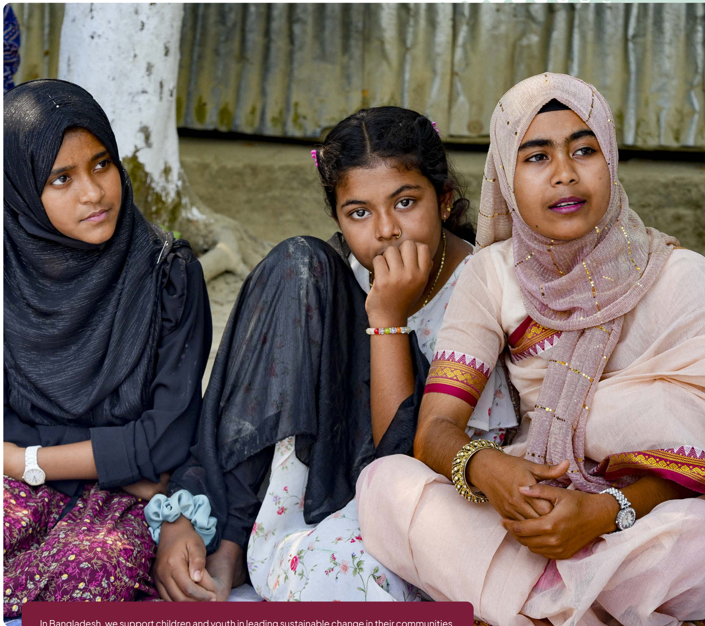
In Bangladesh, we support children and youth in leading sustainable change in their communities.

Since our work is based on locally led development, we follow up on results together with our partners. Among other things, we measure how many children are reached, how partners are strengthened, and what changes occur in children’s health, safety, and education. At the same time, we are clear that results are created jointly and that we do not achieve changes alone; they happen through close collaboration with local actors.