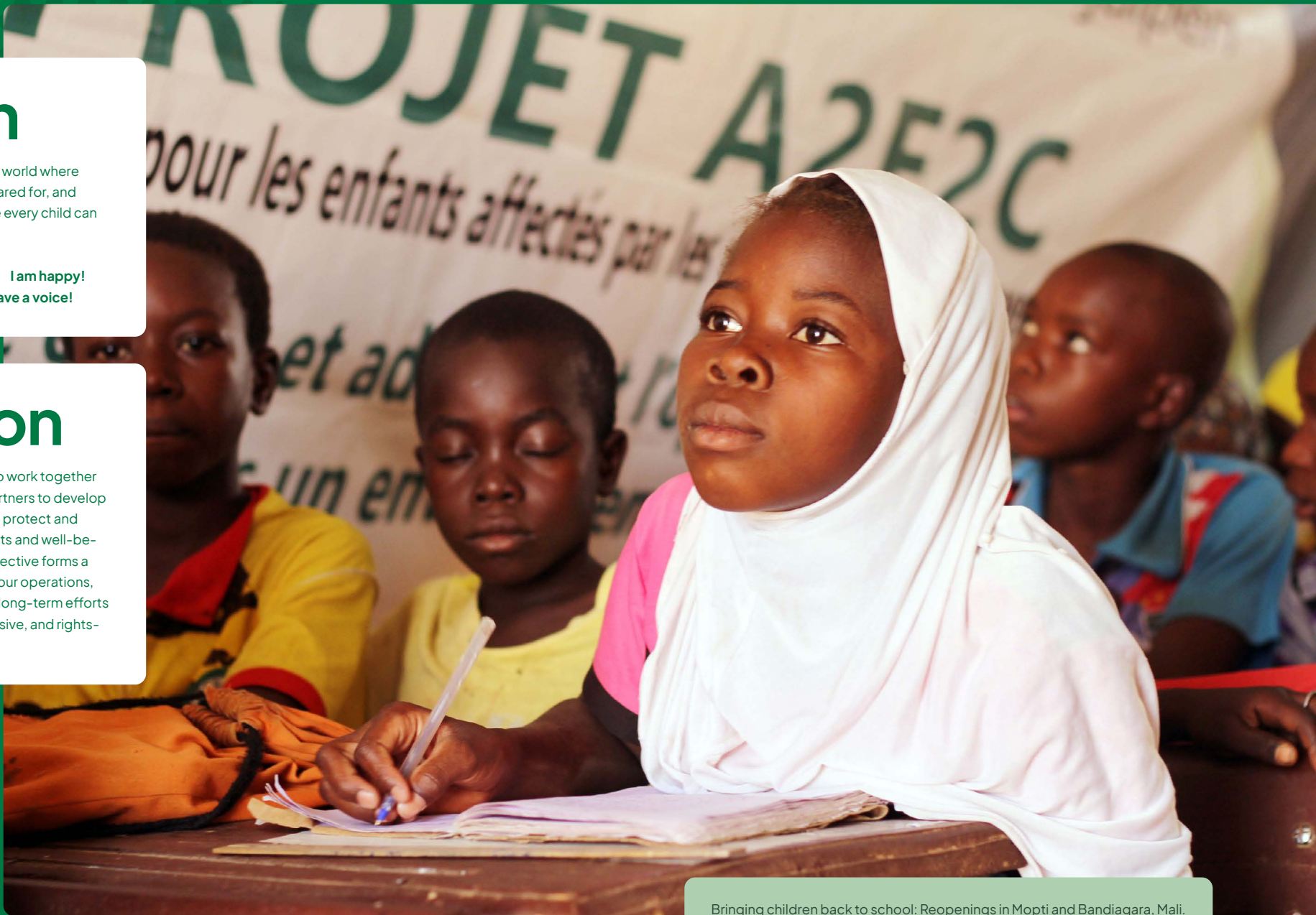
Bringing children back to school: Reopenings in Mopti and Bandiagara, Mali.

Barnfonden's mission is to work together with children and local partners to develop sustainable solutions that protect and strengthen children's rights and well-being. The child rights perspective forms a fundamental principle of our operations, and we uphold it through long-term efforts that promote a safe, inclusive, and rights-based environment.