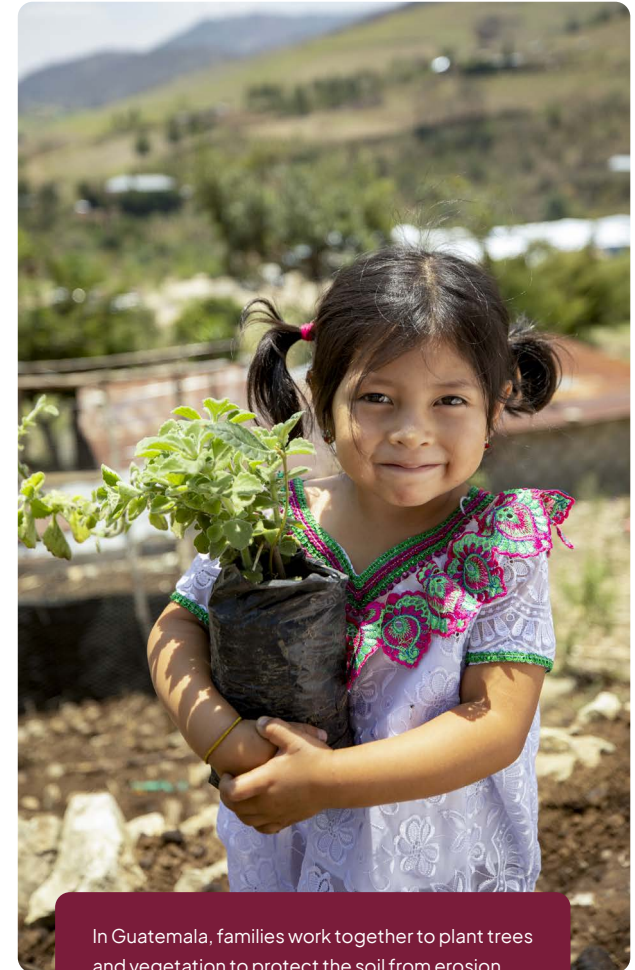
In Guatemala, families work together to plant trees and vegetation to protect the soil from erosion.