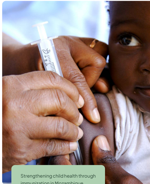
Strengthening child health through immunization in Mozambique.

Barnfonden's work is primarily conducted outside of Sweden's borders. At the start of this strategy period, we reach children in approximately 20 countries across Africa, Asia, Latin America, and Europe.