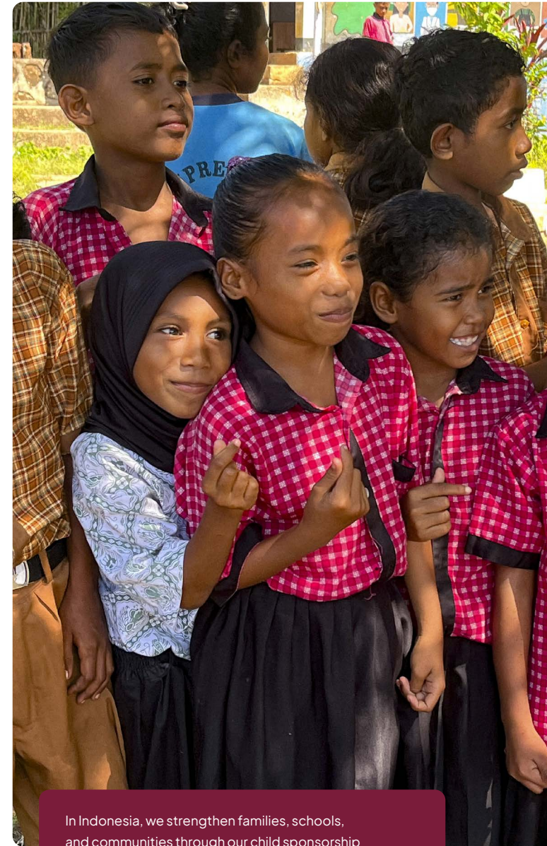
In Indonesia, we strengthen families, schools, and communities through our child sponsorship

Barnfonden enters the 2026–2030 strategy period with a clear conviction: that children’s rights must be defended, strengthened, and realised – even in a world where risks are increasing. Through close collaboration with local actors, the mobilisation of resources, and using our voice for children’s rights in the climate crisis, we are committed to contributing to lasting changes for children, families, and entire communities.