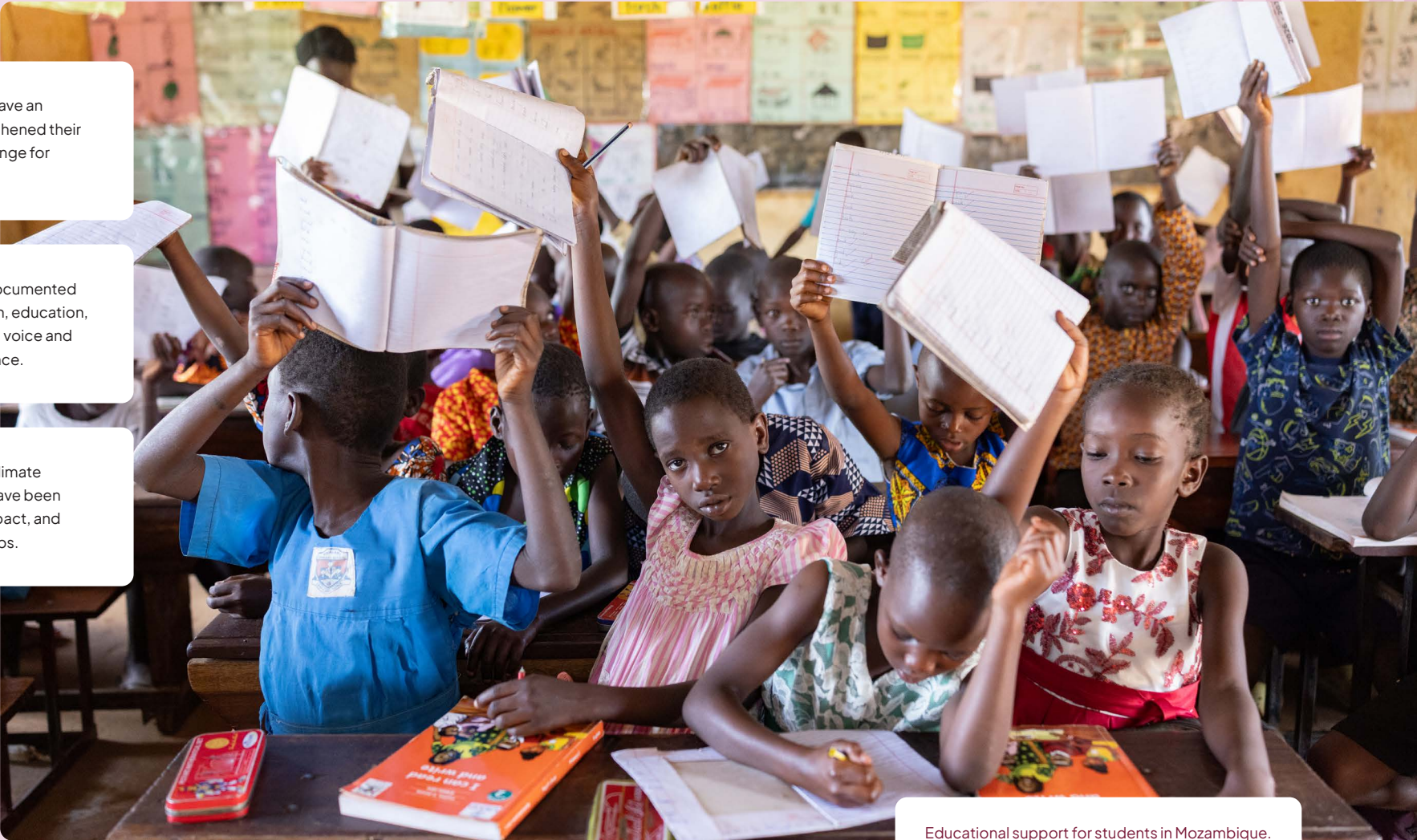
Educational support for students in Mozambique.

Several innovative solutions for climate adaptation and child resilience have been implemented, demonstrated impact, and scaled up through our partnerships.