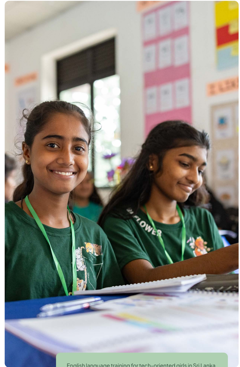
English language training for tech-oriented girls in Sri Lanka.

The strategy 2026–2030 is Barnfonden’s direction for how we strengthen children’s rights in a time of increasing global risks. Through local ownership, long-term partnerships, climate-adapted development work, and the courage to change, we create sustainable results for children – today and for future generations.