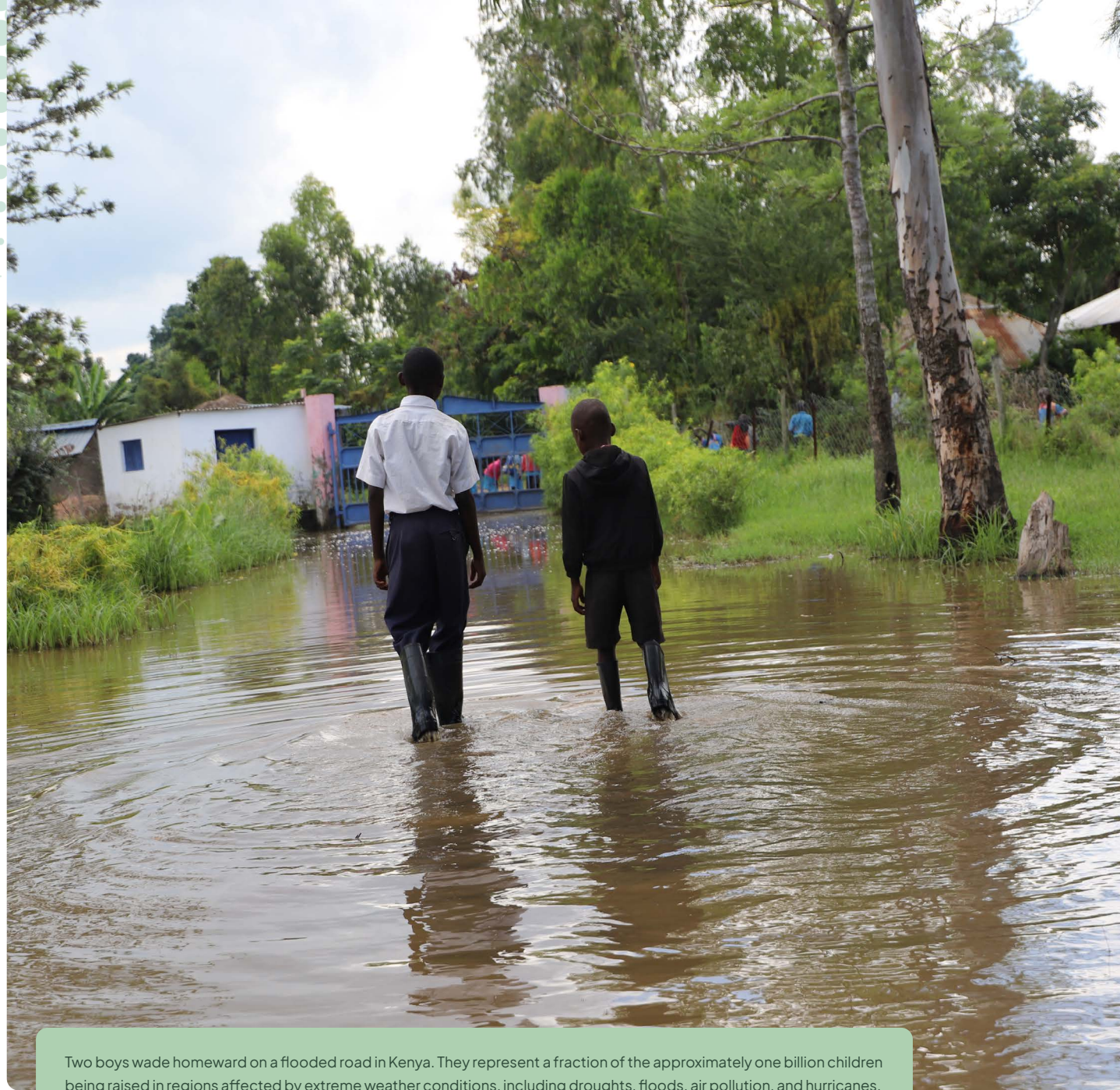
Two boys wade homeward on a flooded road in Kenya. They represent a fraction of the approximately one billion children being raised in regions affected by extreme weather conditions, including droughts, floods, air pollution, and hurricanes.